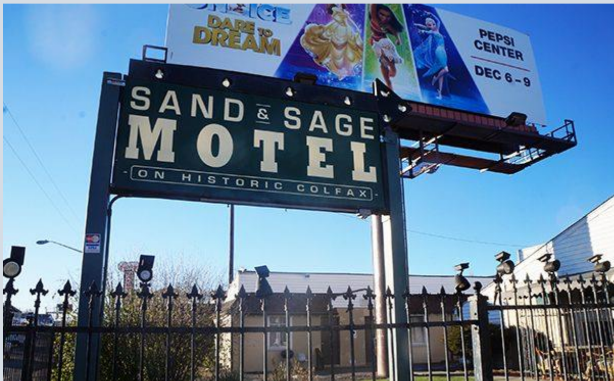
The Sand & Sage Motel at 8415 E. Colfax sold last month for $1.45 million. ( Libby Flood )

A longstanding motel along East Colfax Avenue has changed hands.